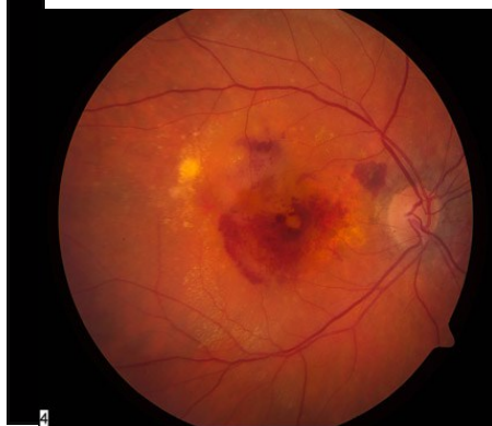
Wet Macular Degeneration